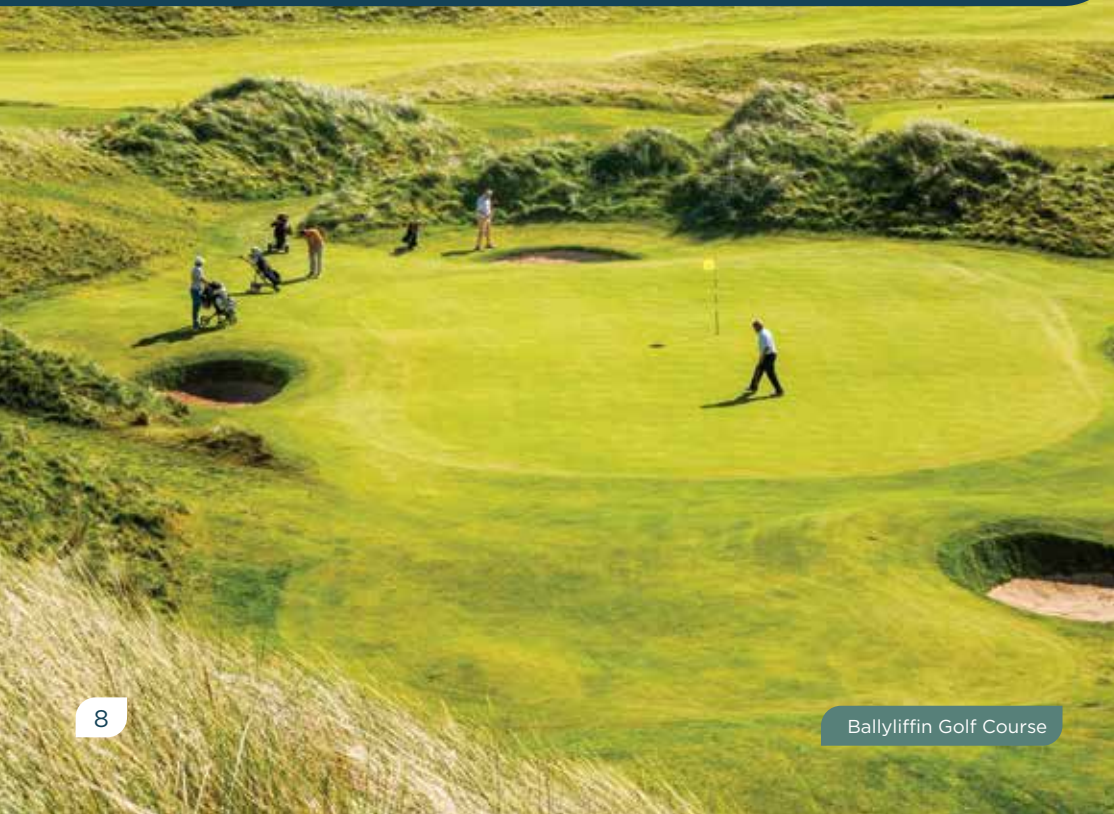
Ballyliffin Golf Course

Tee-off at one of the numerous Championship Links and Parkland courses all over the county, from Ballyliffin to Bundoran. The challenging terrain makes playing golf in Donegal memorable. Not only is the golf great, but this part of the North West of Ireland has the best scenery to go with its greenery!