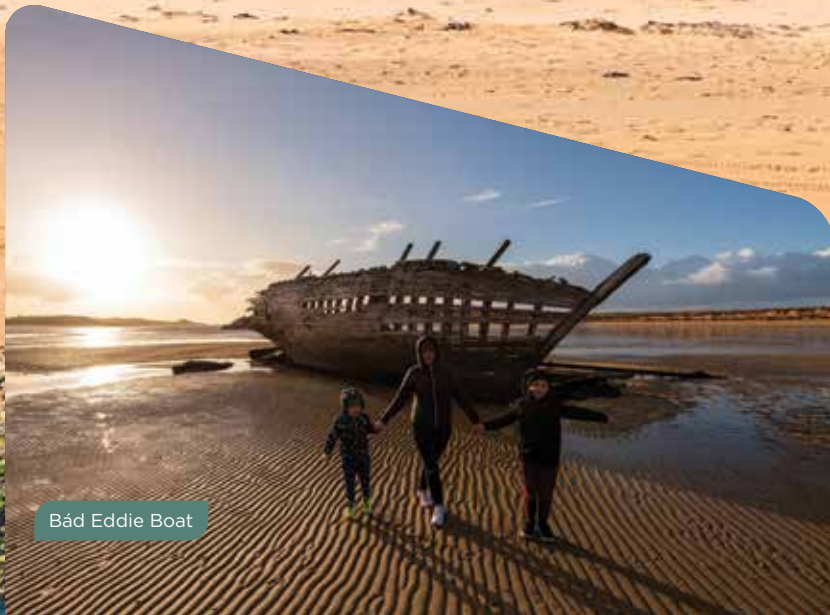
Bád Eddie Boat