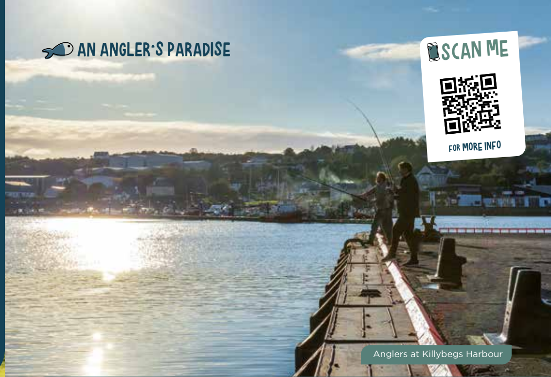
Anglers at Killybegs Harbour

ONE VISIT TO DONEGAL'S WATERWAYS AND WE GUARANTEE