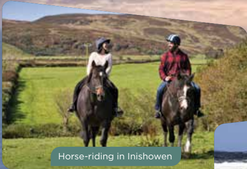
Horse-riding in Inishowen