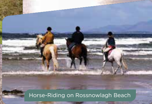
Horse-Riding on Rossnowlagh Beach