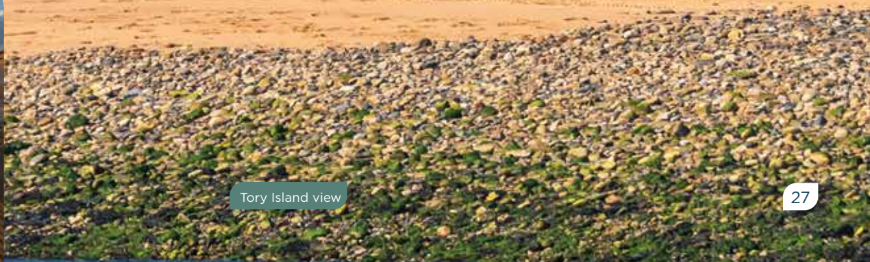
Tory Island view