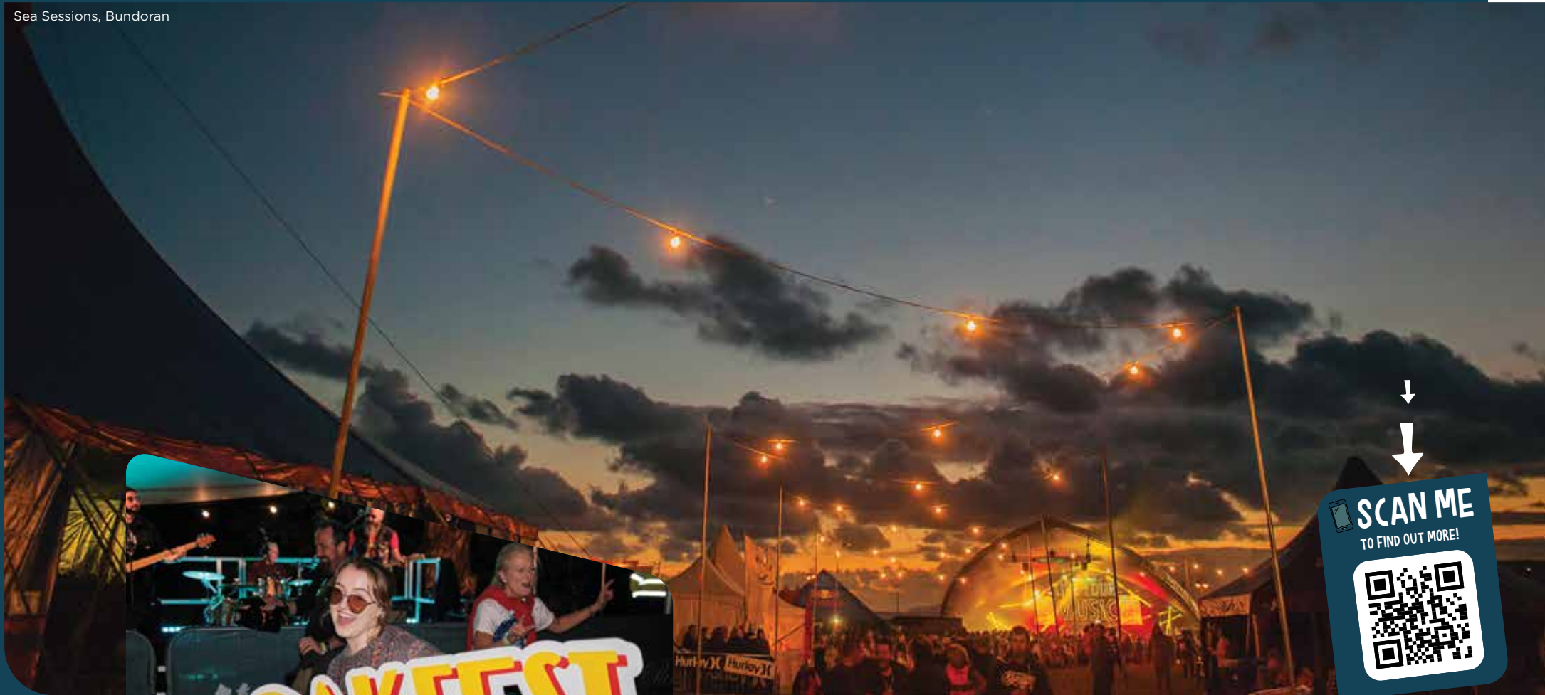
Sea Sessions, Bundoran

Donegal boasts a year-round programme of unique and exciting festivals and events with something to suit every taste.